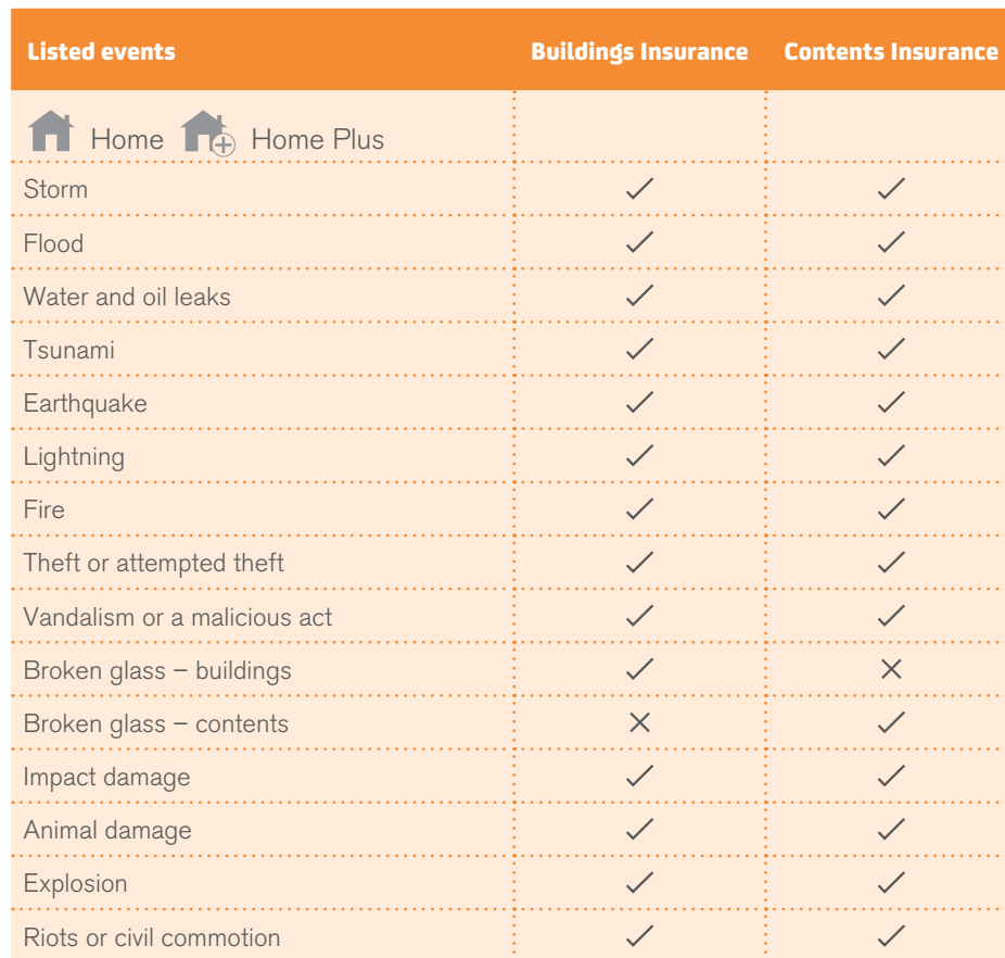
Table 3.1 – Listed events