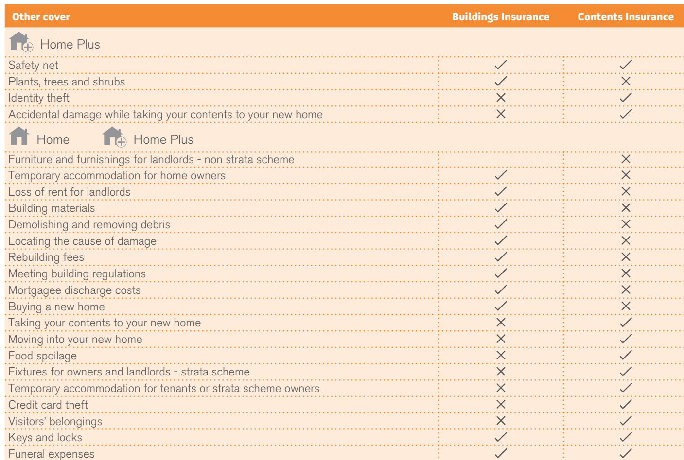
Table 3.2 – Other cover